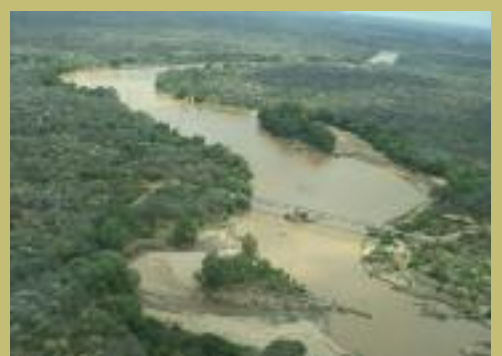
Bridge across the Tana River, linking Meru National Park and Kora National Park