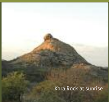
Kora Rock at sunrise

Mkomazi National Park, especially the Mkomazi Rhino Sanctuary, still needs our full support, but with our highly motivated and well-trained team in place and TANAPA with the reins of the future in their hands, we will have more time to involve ourselves in Kora. We sincerely hope that you will join us in supporting Kora and our welcome back there.