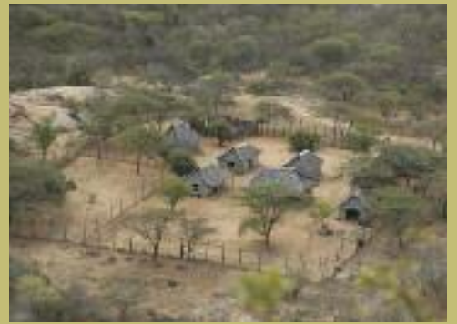
George Adamson's camp, rebuilt by GAWPT

GAWPT has also contributed in many ways to the welfare of the local villagers in Asako village with food, Flying Doctor visits, dispensary help and water projects, including a 30 foot water windmill pump. Prince Bernhard Fund for Nature,