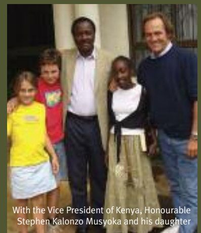
With the Vice President of Kenya, Honourable Stephen Kalonzo Musyoka and his daughter

Park, overseeing Kora and Rahole. There are many challenges to face up there but we cannot afford to let the chance pass by, especially when we have been given such an extraordinary chance. We are working on a Memorandum of Understanding, talking to all our Trustees, looking for new support and the beginnings of a workable plan are taking shape.