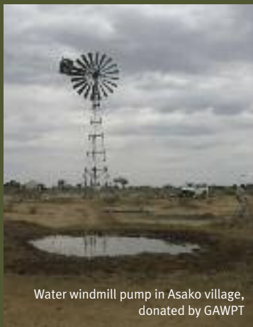
Water windmill pump in Asako village, donated by GAWPT