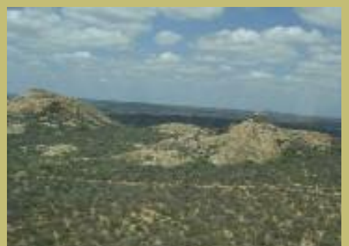
Kora National Park