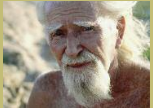
George Adamson at Kora 1987